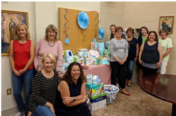
The Daughters of Erin with some of the many baby shower gifts for Birthright in Leesburg.