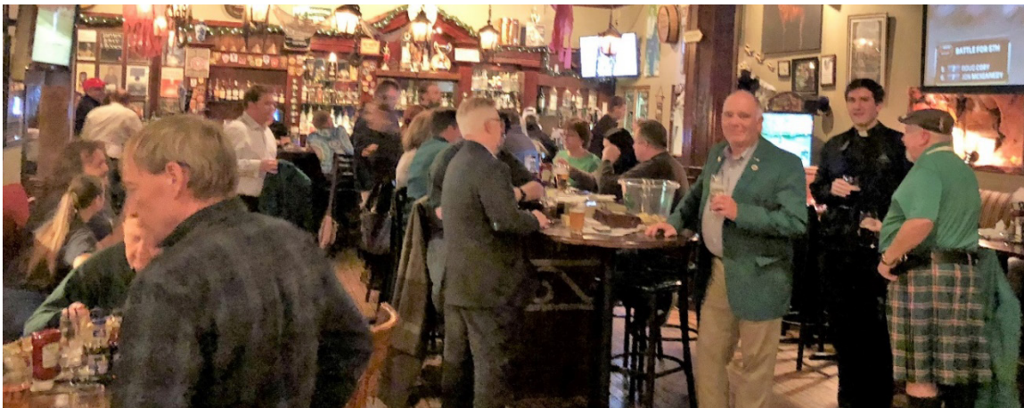
A portion of the large turnout at O'Faolain's for the Half-way Party.

The following pictures are just a few of the many attendees and highlights from this year's party.