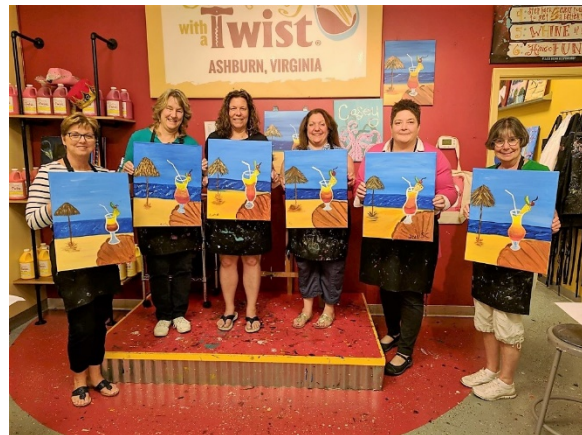
Some team building fun in Ashburn with art.