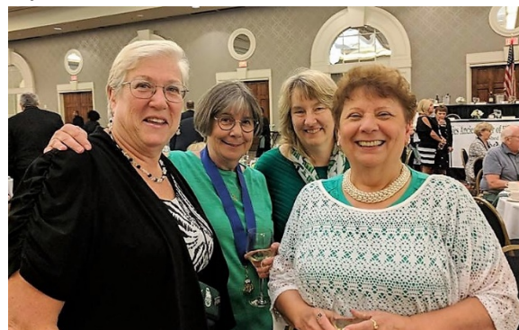
The Daughters of Erin delegates with another member of the Virginia LAOH delegation.