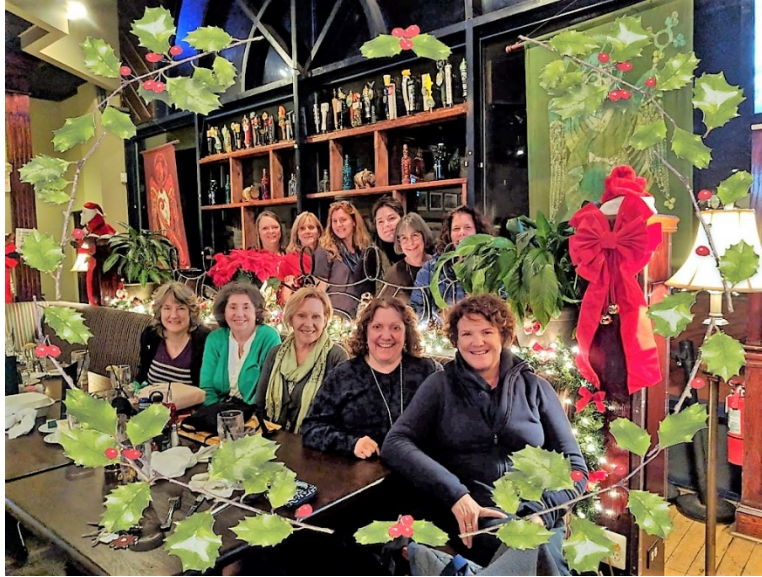
Members of the Daughters of Erin at their November meeting and social gathering at O'Faolain's Pub in Sterling.