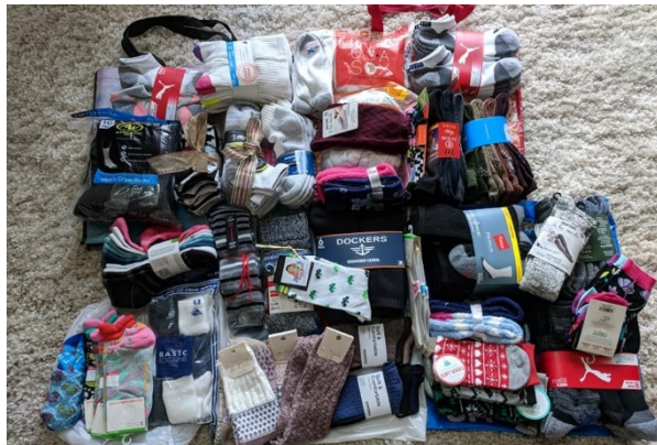
Some of the socks gathered by the Daughters of Erin for Mobile Hope.

Mobile Hope, based in Leesburg, provides services and clothing to teens and young adults who are homeless and in need in Loudoun County. The LAOH has undertaken gathering donations of socks to assist Mobile Hope in their mission of service. Socks are an extremely important item needed by many during the cold winter months.